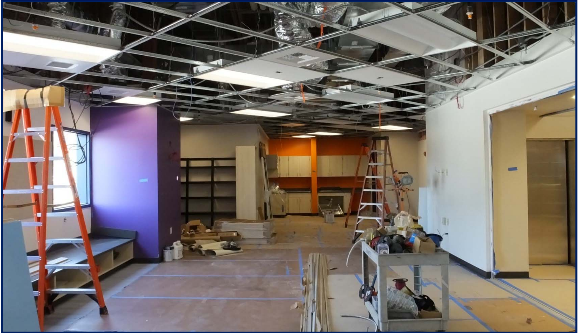
Cherrywood FIS – FIS Space Looking East