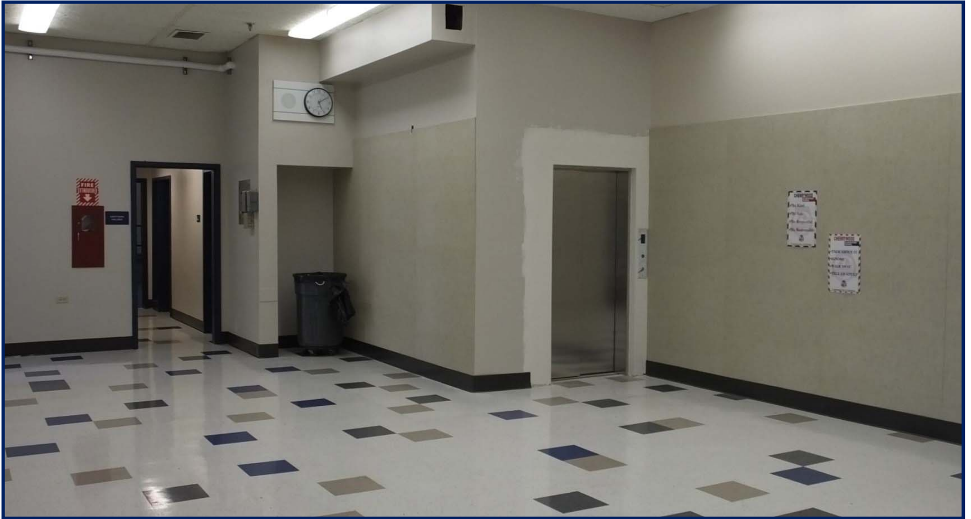
Cherrywood FIS – Kitchen Area - August